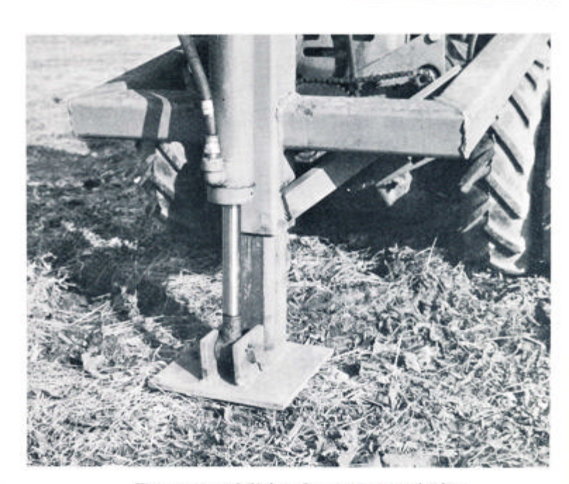
The rear stabilizing leg prevents tipping.

Anyone who digs ditches should seriously consider the money-saving */ Textamile / #