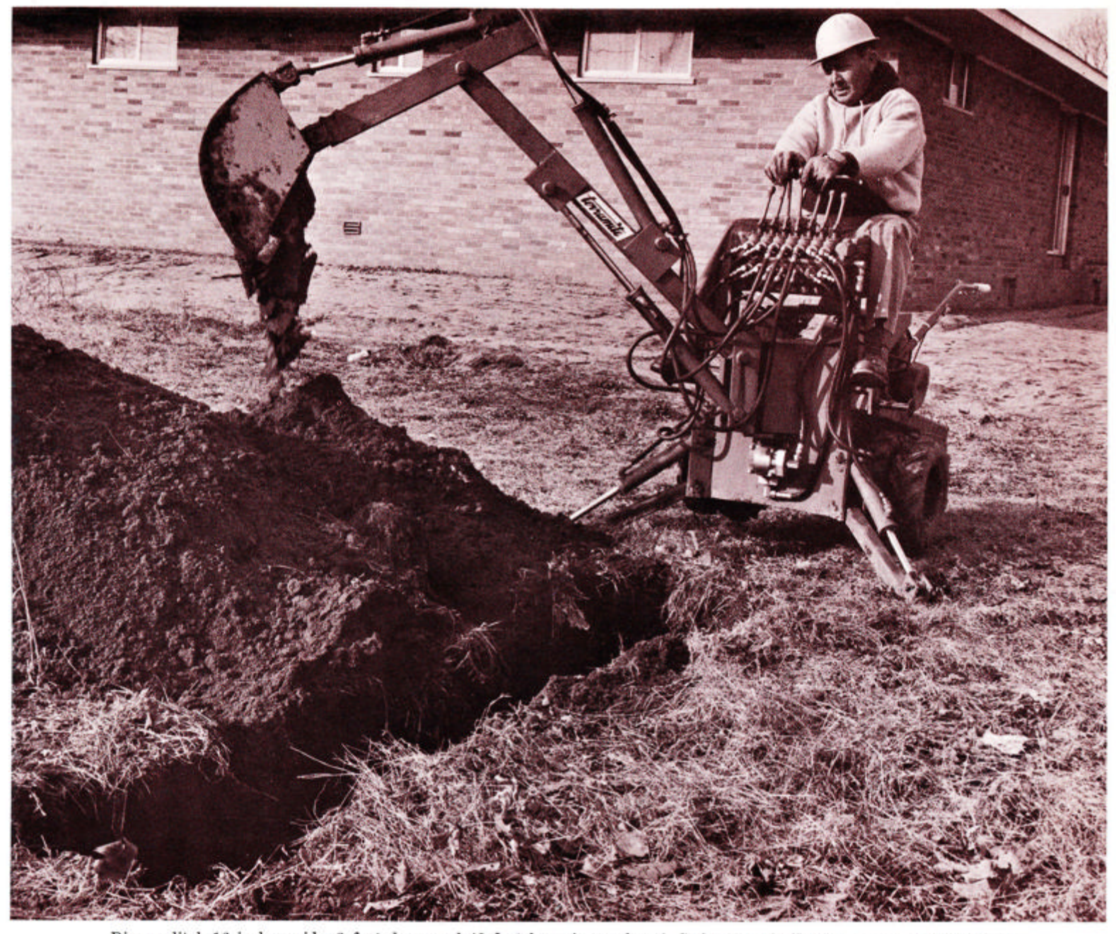
Digs a ditch 16 inches wide, 3 feet deep, and 40 feet long in one hour! Swings vertically 90° . . . 45° to either side.