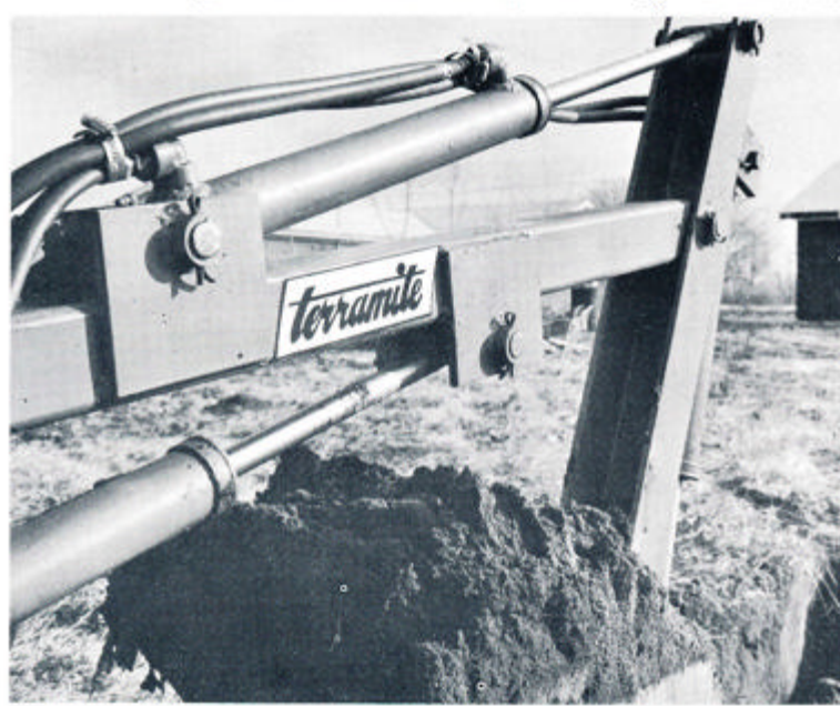
Save dollars every time the bucket takes a big bite.