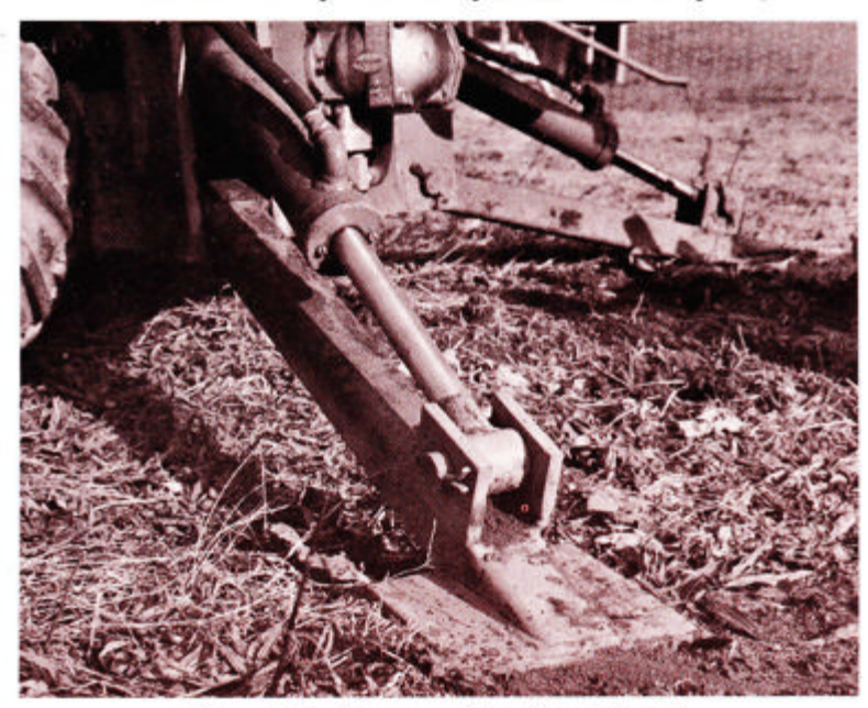
Retractable legs speed leveling and get you through narrow gates like a breeze.