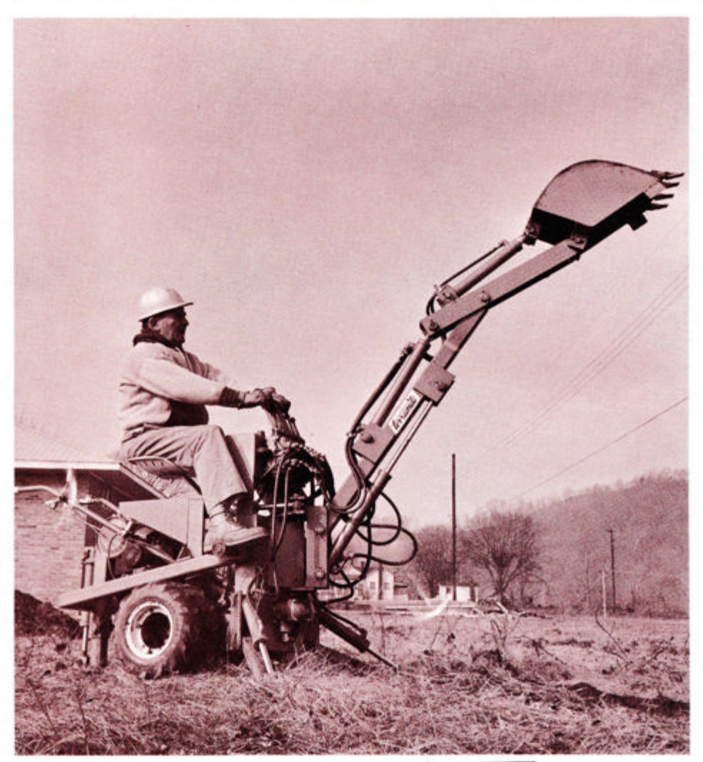
Make more money with "the terrific /terramite/."