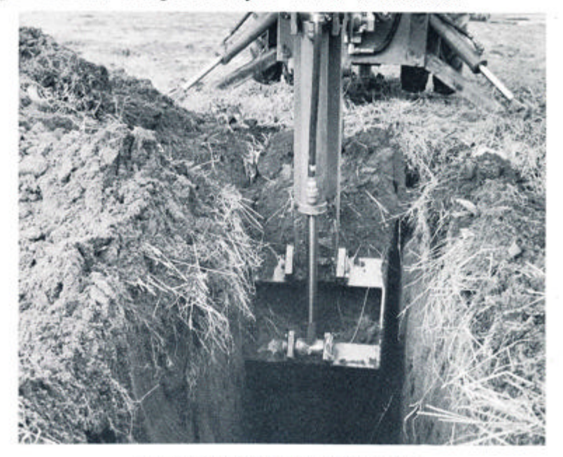
Bucket digs 6 feet and 4 inches deep.